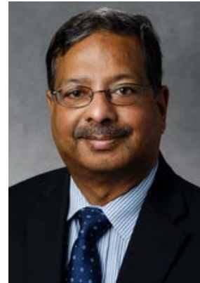
Associate Dean Graduate Programs in Engineering & Software