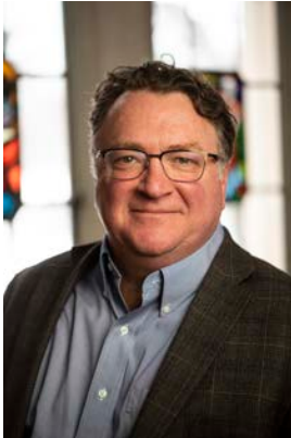
Dean School of Engineering