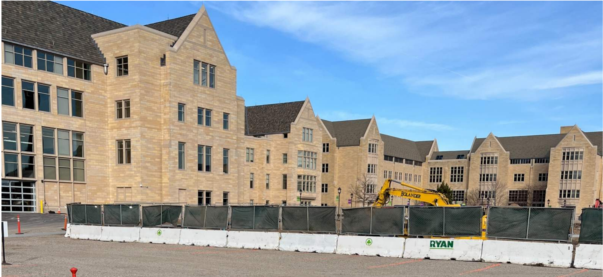
Final Grading completed near Schoenecker