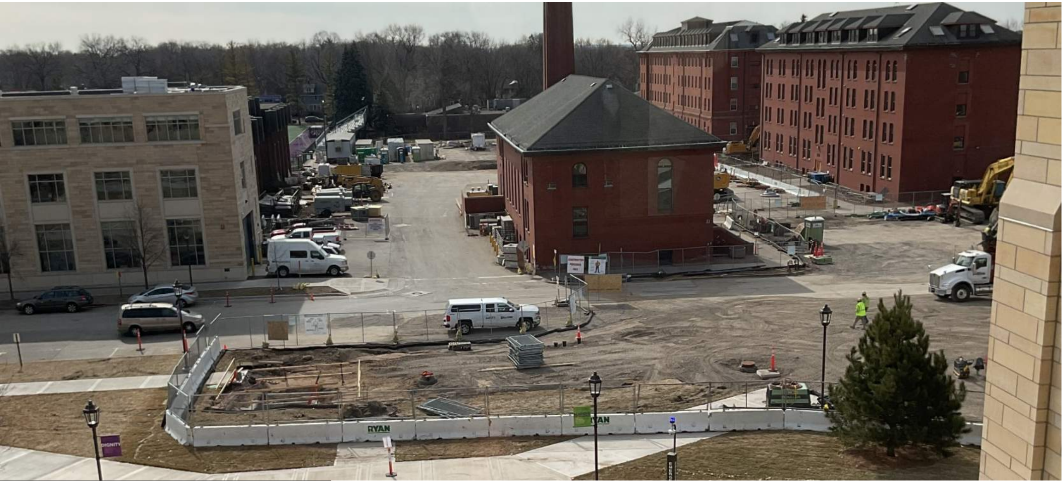
Schoenecker – Looking towards Service Center and Cretin