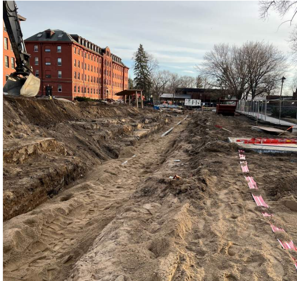
Utilities being placed West of Cretin