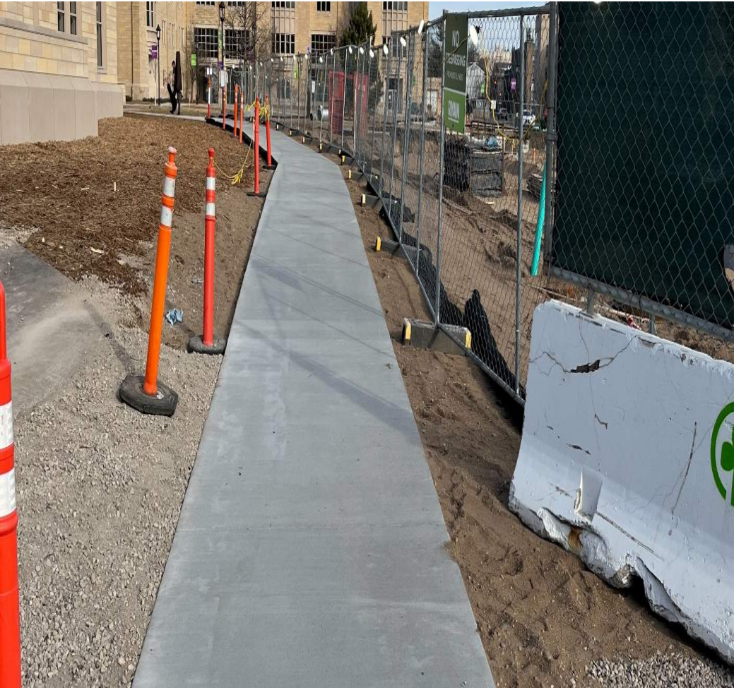
Temporary sidewalk in place South of Schonecker