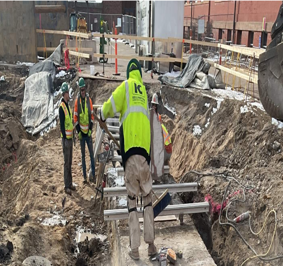
February duct bank, utility work.