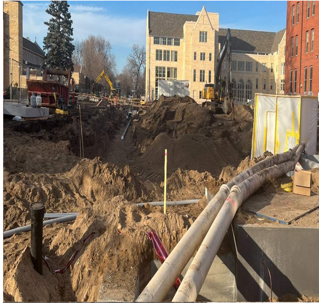
Utilities being placed West of Cretin