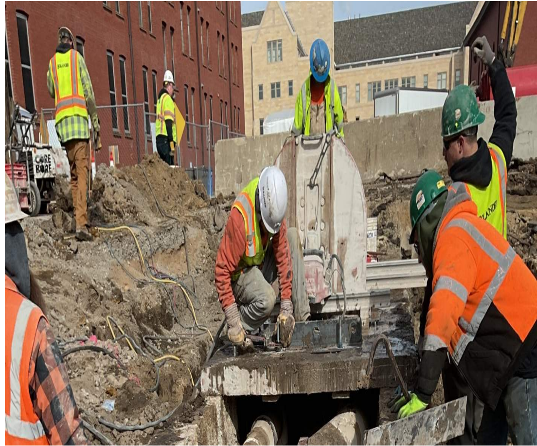
Utility installation West of Service Center