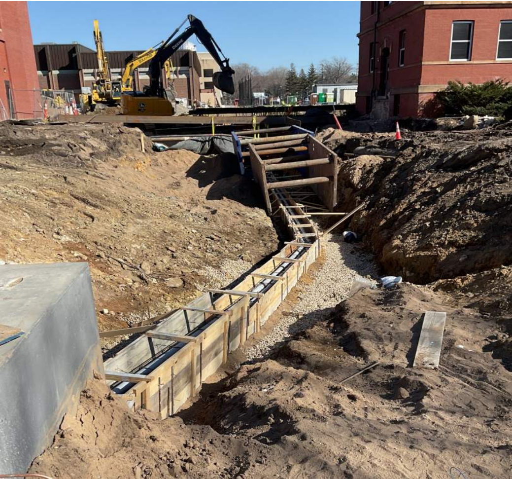
Utility work in-between Cretin + Grace.