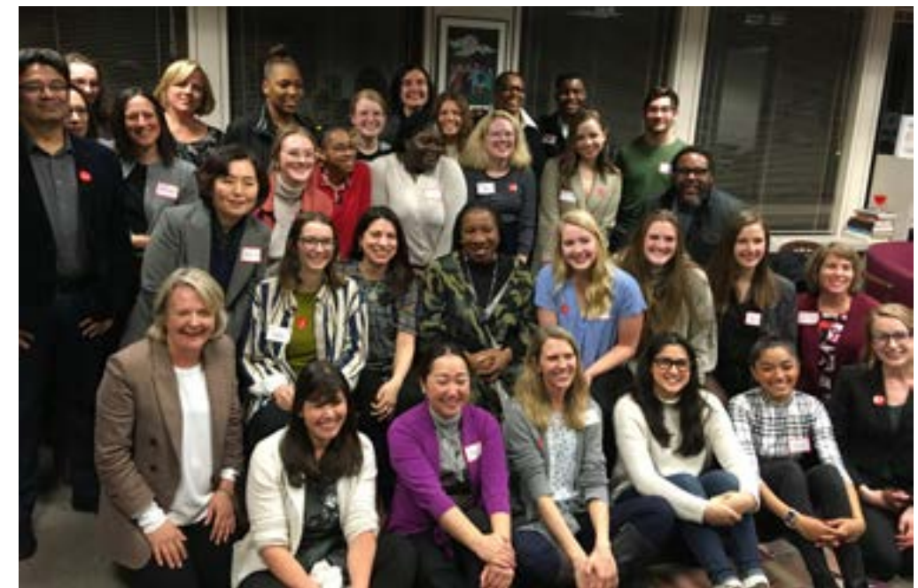
Members of the St. Thomas community excitedly gather with Tarana Burke before her Women's History Month Lecture

But that anger turned into gratitude when I thought about all the experiences that I have had, and not mourning those I won't. While it would have been nice to walk across that stage and celebrate with my best friends, I know that I don't need it. It isn't the end that makes life meaningful, it is the turbulence of the middle. Late night "studying" with friends, getting lost abroad, and Femcom meetings mean much more. I know I'll be carrying the pieces of the last four years everywhere I go.