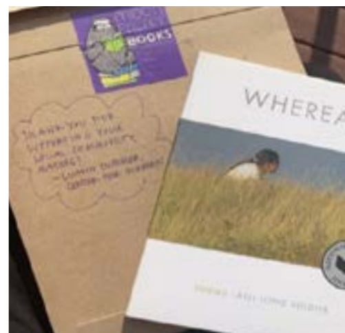
Book from Moon Palace Books