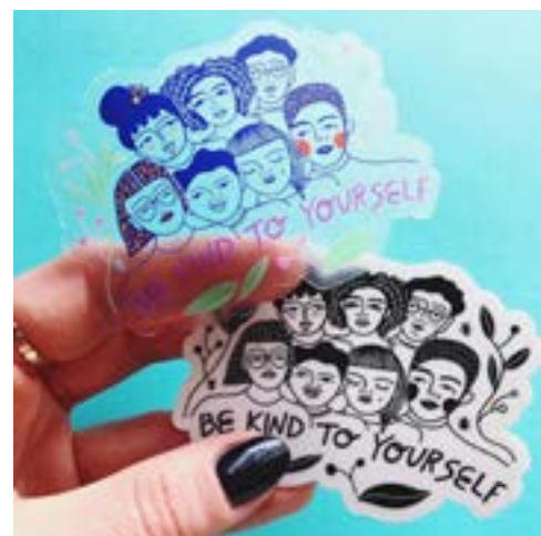
Stickers by RarePress

My student worker project for this semester was a social media campaign focused on community. At a time where we had to be physically separated, I wanted an easy way to remain in conversation with our community. I asked our followers to share how they were supporting their community during this time. This looked different for different people. Some shared their support for local businesses and performers, while others shared about checking in on their friends and volunteering. Everyone who responded was entered to win a prize pack from a local, woman-owned business or artist. Although I miss the excitement of in-person events, I feel like this was a fun way to check-in with our community while encouraging interactions with broader communities as well.